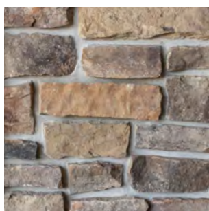
*Full Veneer: Call for Availability