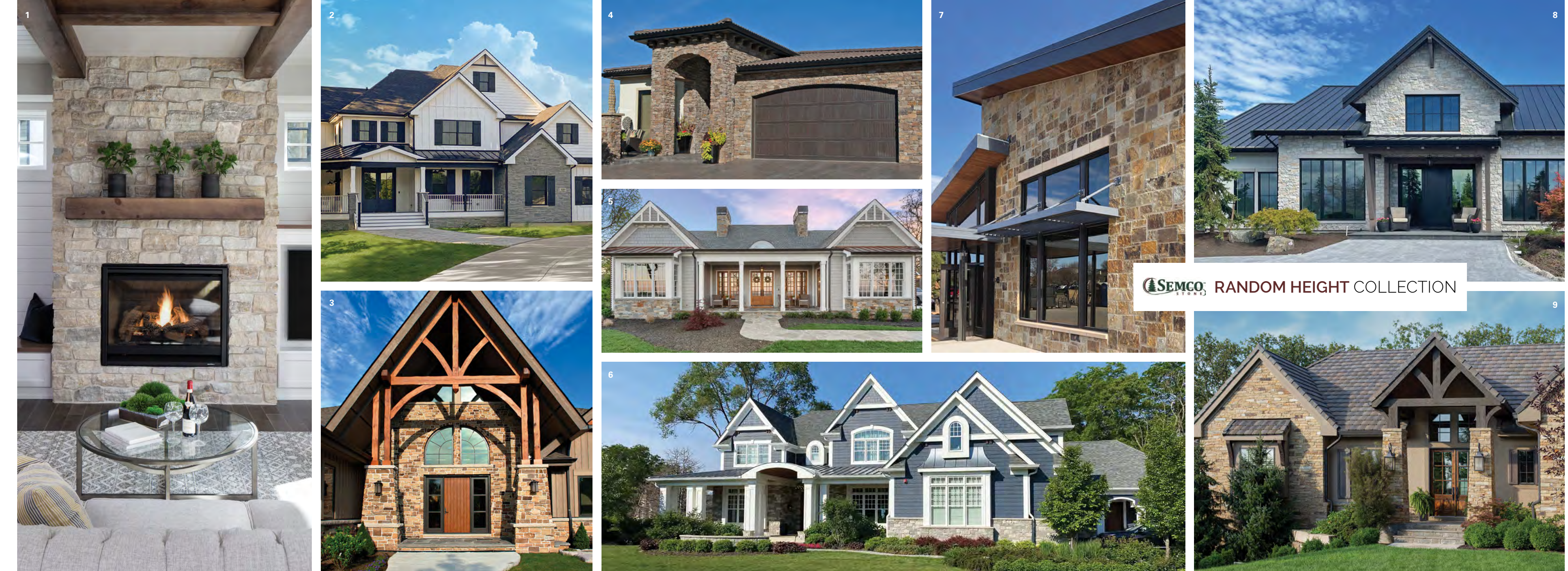
1. Mountain Ridge 2. Blue River 3. Brentwood 4. Legacy Falls Weathered 5. Bristol Bay 6. Chateau Bay 7. Chestnut Hill Castlerock 8. Mountain Ridge 9. Black Hills Rustic