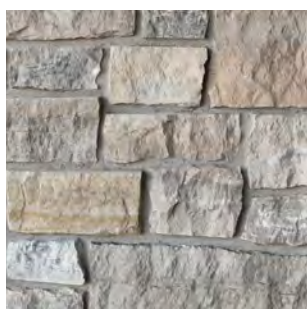
RANDOM HEIGHT COLLECTION