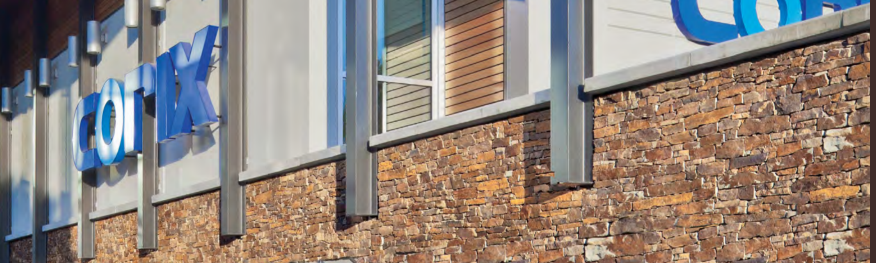
SHOWN ABOVE: Yukon Ledge