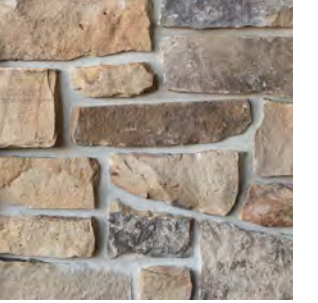
*Full Veneer: Call for Availability