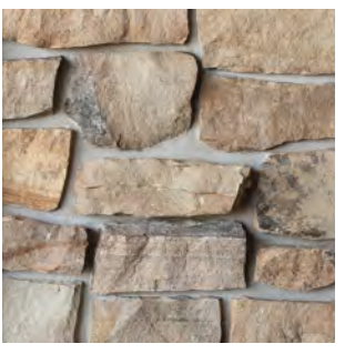
*Full Veneer: Call for Availability