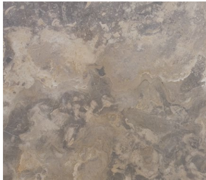
Antique Brush Finish